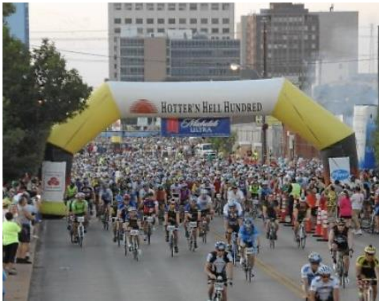
Start and finish near MPEC.